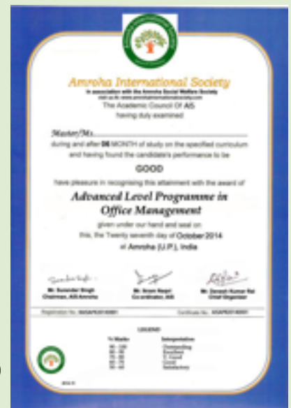
Above: Certificate presented to students of the AIS computer course at the graduation ceremony in October 2014

In the next few months it will be totally revamped to become more user-friendly and informative. Please give us your feedback.