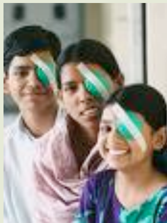
In India, 80.1% of sight-impaired people are blind due to cataract

Cataracts are the leading cause of blindness in the world. In India, 80.1% of sight-impaired people are blind due to cataract. Given the numbers (around 12 million blind people) there is an enormous backlog of cataract operations and experts have cited the need for collaboration between non-government organizations and the public sector to expand coverage to the most disadvantaged populations. (Source: R.B. Vajpayee, Sujata Joshib, Rohit Saxenaa, S.K. Gupta, "Epidemiology of Cataract in India: Combating Plans and Strategies", Ophthalmic Research 1999;31:86-92).