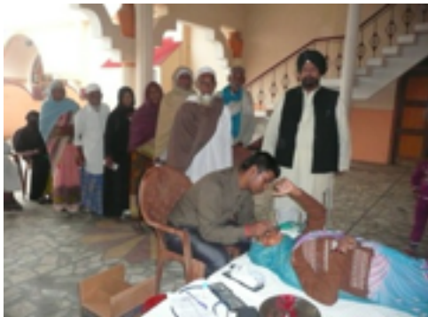
Eye testing at the cataract camp