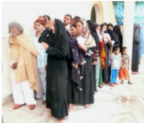
Patients lining up for treatment