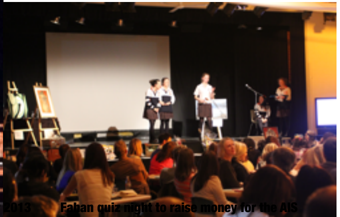
Fahan quiz night to raise money for the AIS