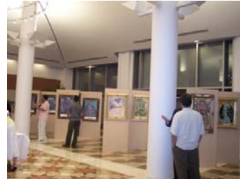
Sadequain Foundation exhibition Washington DC

A third exhibition is scheduled for September 8, 2007 at Alient University, San Diego