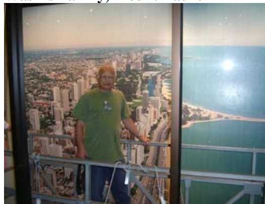
View from Sear's Tower