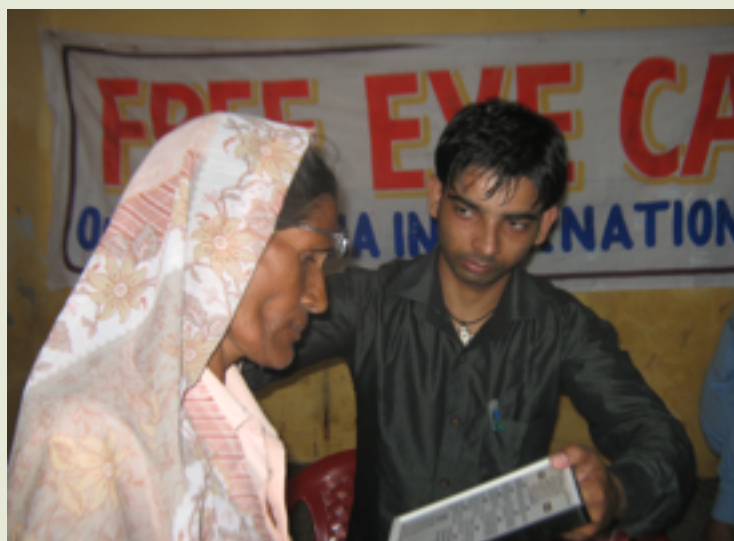
AIS Cataract Camp on 12 September 2012

See more photos of the Eye Camp on page 3.