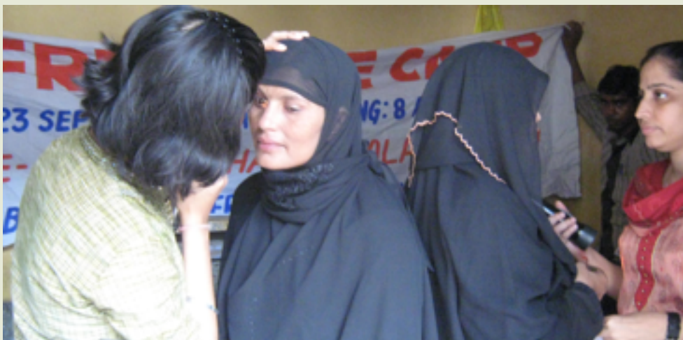
Women being screened for cataract at the Cataract Camp on 23 September 2011

AIS funded two Cataract Camps which took place on 14th April and 23rd September 2011. At the April Cataract Camp, 310 patients were screened. Of these, 17 were identified as cataract patients and were transported to New Delhi for surgery. Of those who were tested by optometrists, 40 were given free glasses. Another 200 people were given medicine at no cost for minor eye problems. The September Cataract Camp was also highly attended, with 307 people screened. 24 were taken to New Delhi for a cataract operation. 49 people were given free glasses. See more photos of both camps on page 3.