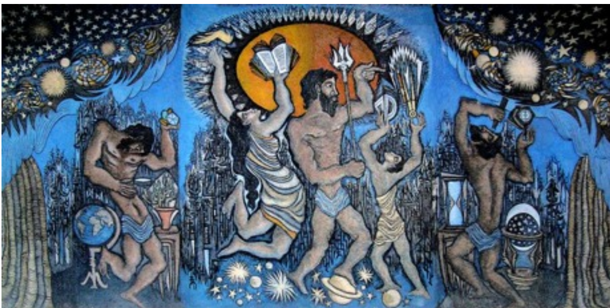
Mural (30 x 15 feet) by Sadequain titled, “Quest for Reality” gift to Banaras Hindu University

During his stay in Aligarh, Sadequain designed and completed a large mural for the Maulana Azad Library and an abstract mural in metal cutouts for the wall at the entrance to the Department of Geography. In Delhi, he held a major exhibition sponsored by the State Lalit Kala Academy at Rabindra Bhavan. Before returning to Pakistan in December 1982, Sadequain painted and gifted murals to Urdu Ghar, Indian National Geophysical Research Institute at Hyderabad, and a large mural titled “Quest for Reality” to Banaras Hindu University, to name only a few.