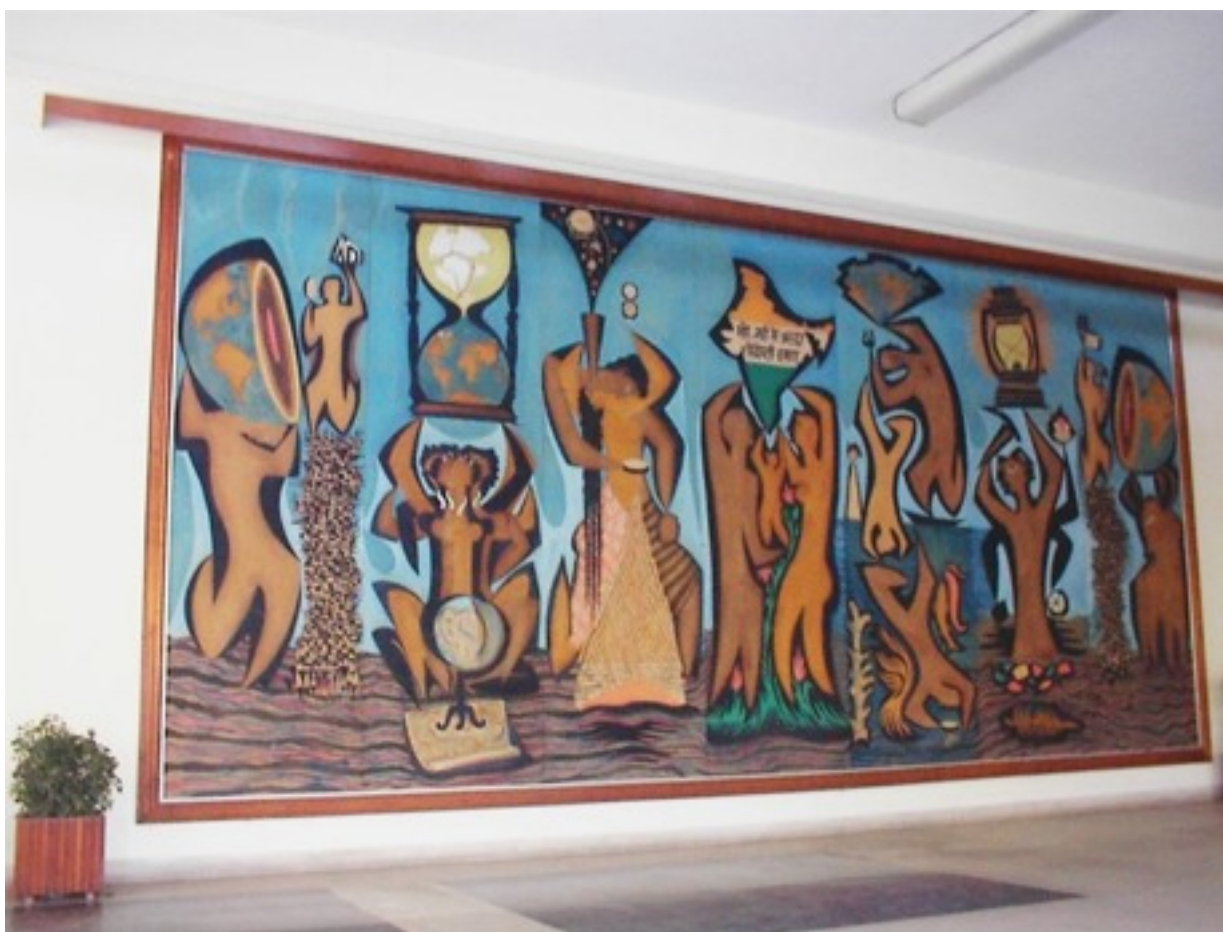
Sadequain's mural (35 x 12 feet) at National Geophysical Research Institute in Hyderabad

work, Sadequain would cherish the fruits of his labor in time for his 24 th anniversary in February 2011.