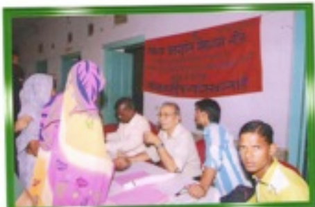
Patients registering for treatment