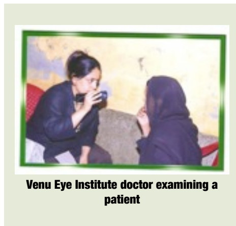
Venu Eye Institute doctor examining a patient