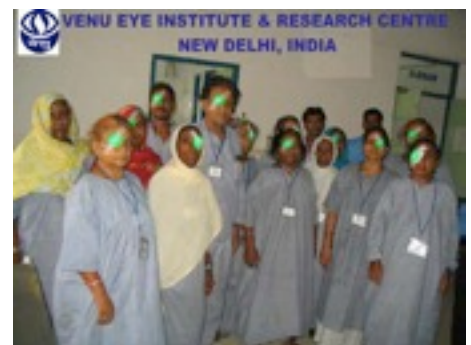
Patients having been operated on