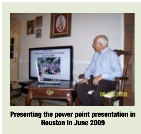
Presenting the power point presentation in Houston in June 2009

The responses to the presentations were excellent and resulted in both