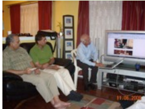
Amrohivis attending the Toronto meeting

AIS presentation in Toronto on 11 June 2009