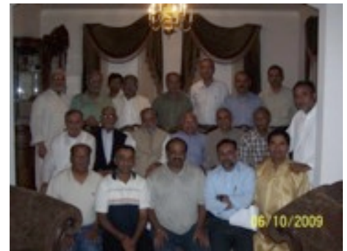
Amrohivis in Houston attend meeting