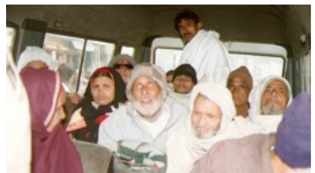
Patients being taken in the bus