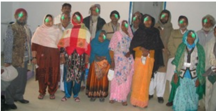
Patients after operations