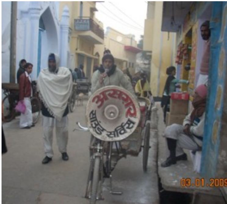
Advertising the camp by rickshaw announcements