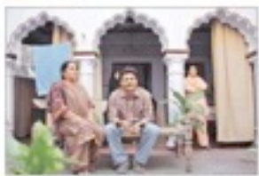
Shouldn't mother and brother of their home in America.